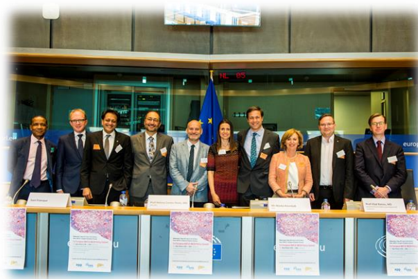
May 2017 in European Parliament