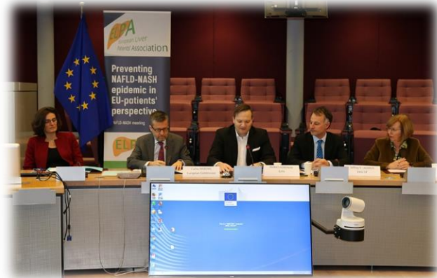
January 2019 at European Commission